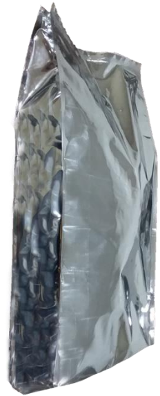
BULK ALUMINIUM FOIL PACKAGING

Our stock is established to keep tea away from heat , light and humidity . In addition we package tea in 3-5 kg aluminum foil bags to keep the perfect aromas , taste and increase the shelf life to it's maximum!