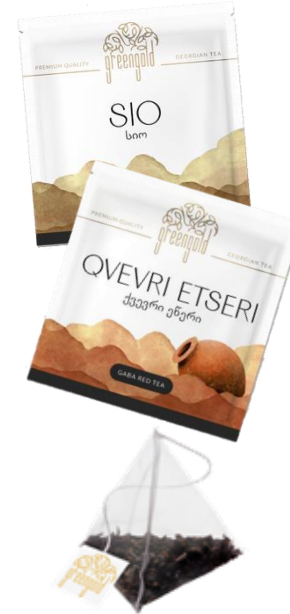
RETAIL PYRAMID PACKAGING

Greengold has retail packages 30g , 50g, 100g. Pyramid bags of 2,5-3g packaging. Also Greengold gives possibility to package tea with custom brand, according to customer's needs.