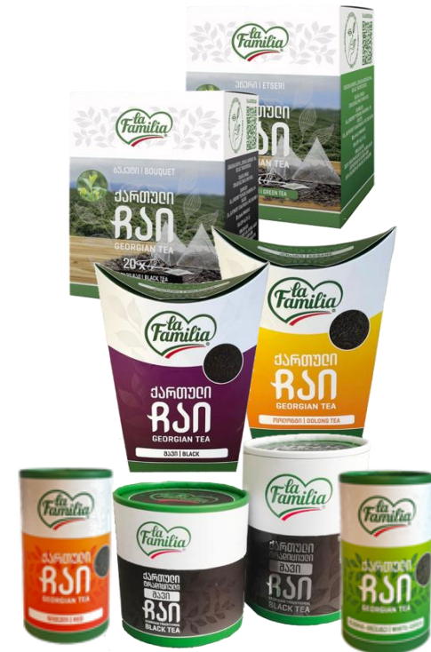
RETAIL PACKAGING WITH PRIVATE LABEL

Greengold has retail packages 30g , 50g, 100g. Pyramid bags of 2,5-3g packaging. Also Greengold gives possibility to package tea with custom brand, according to customer's needs.